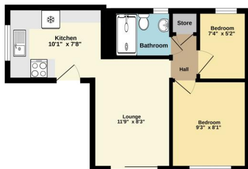
Annex 336 sq.ft. approx.

Whilst every attempt has been made to ensure the accuracy of the floorplan contained here, measurements of doors, windows, rooms and any other items are approximate and no responsibility is taken for any error, omission or mis-statement. This plan is for illustrative purposes only and should be used as such by any prospective purchaser. The services, systems and appliances shown have not been tested and no guarantee as to their operability or efficiency can be given. Made with Metropix ©2022