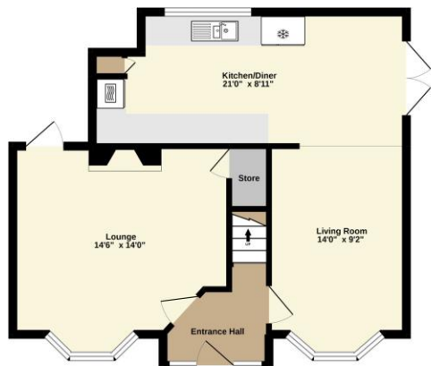
GROUND FLOOR 537 sq.ft. approx.